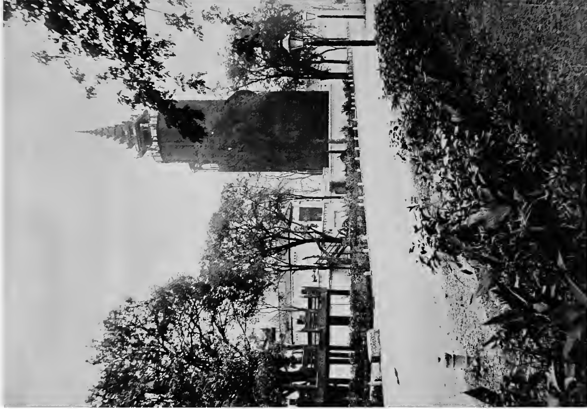
The Watch Tower, Fort Dufferin, Mandalay